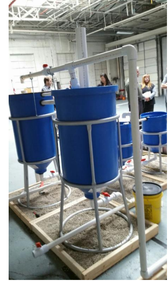
Flint Aquaponic Center

Aquaponics is the integration of aquaculture (fish farming) and hydroponics (growing plants in water) in a water-circulating, soil-less system. The natural bacteria in the ecosystem converts waste from the fish to nutrients which are absorbed by the plants and removed from the water. This growing method, scalable from small backyard gardens to large commercial systems, requires minimal water usage and no chemical fertilizers while providing organic produce and fish from the system.