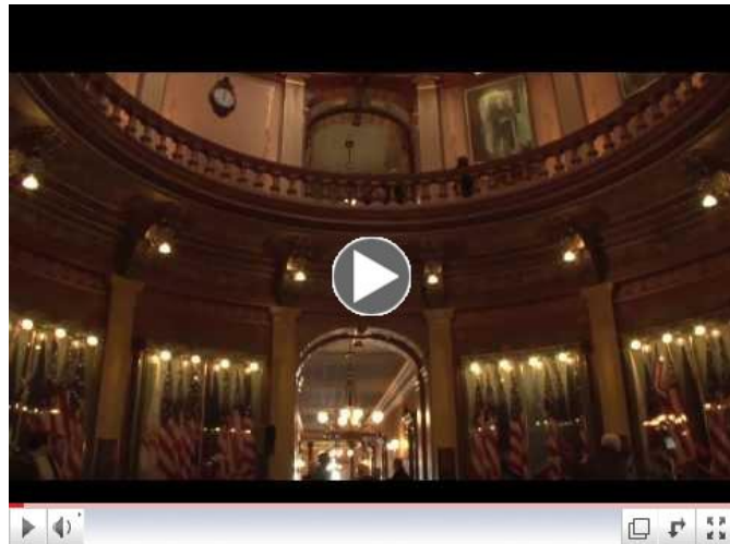
CCED Contemporary Issues Institute Highlight