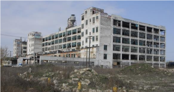
Figure 2: Fisher Body Plant - Detroit, MI