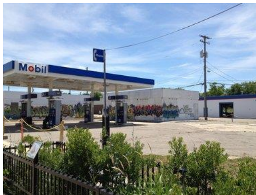
Figure 4: Abandoned Commercial Property Lansing, MI

Abandoned commercial properties in communities can pose a threat to public health and safety and occur in large and small communities throughout the State (see Figure 4). These abandoned properties threaten public health and safety and negatively affect the aesthetics of the surrounding region deterring other businesses or developers from investing. It is estimated in Detroit, Michigan that 36% of commercial properties are vacant (Detroit Works Project, 2012).